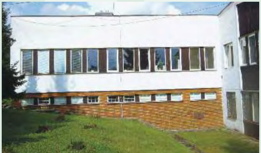
First step in Čierny Balog: Thermal insulation.