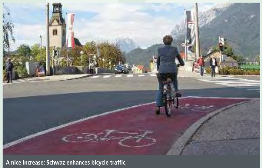
A nice increase: Schwaz enhances bicycle traffic.