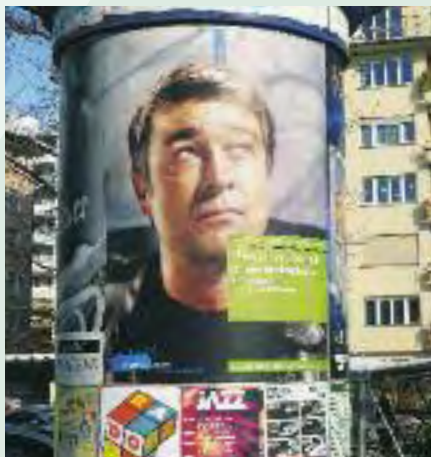
TV police inspector Reto Flückiger promotes climate protection in Lucerne.