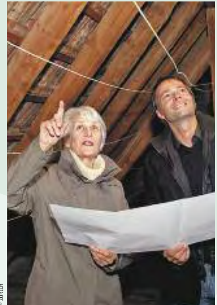
21 energy coaches consult private builders and planning professionals.

In 2008 more than three quarters of all Zurich residents voted for the 2000 watt society. Reduction of energy consumption by two-thirds, one ton of CO 2 per person at most and the doing away entirely with nuclear energy were the central elements of the path Zurich chose. Zurich is now right in the middle of implementation. The Energy Coaching pilot project is intended to ma-