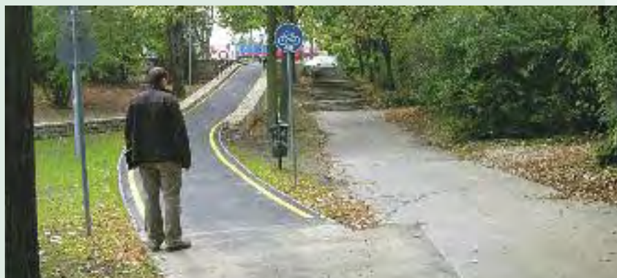
New bike lanes for one of the oldest cities in Hungary, Veszprém.