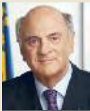
Prov. Governor Dr. Erwin Pröll

T ogether, the Climate Alliance Europe and the province of Lower Austria will award Climate Stars to communities throughout Europe, and who would not like to receive the prize? Such awards are an ideal way to bring about changes in habits or to motivate people to stick with it. We desperately need this paradigm shift and we need it in many areas to slow global warming. Greenhouse gas emissions are still moving in the wrong direction.