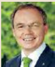
Prov. Env. Council Stephan Pernkopf

need to question our current lifestyle and to act. Lower Austria, which anchored climate protection in its constitution as early as 2007, has taken the initiative and has set ambitious goals. One hundred percent of electrical power needs are to come from renewable energy by 2015 and 50 percent of overall energy needs by 2020. In addition we