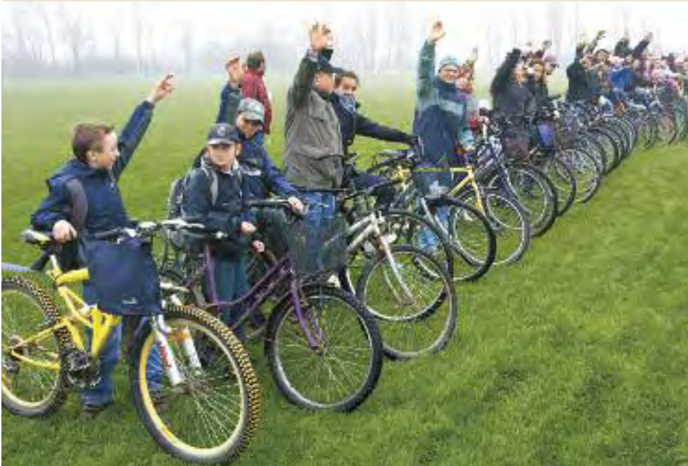
Outstanding projects initiate the energy transition across the continent.