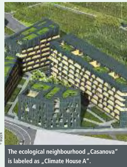
The ecological neighbourhood „Casanova” is labeled as „Climate House A”.

Casanova/Kaiserau and Drususstraße. Both meet the criteria for the Climate House A label. If they were heated with oil consumption would be a mere three litres a year for each square meter. The Casanova buildings with their 950 residential units were designed so that they shaded one another as little as possible. In addition a railway station is built on the Bozen-Meran rail line. The CO 2 -neutral neighbourhood Drususstraße is now in planning. By 2014, 550 new apartments will be built. The new neighbourhood is also well connected to the public transportation network. Car-share spots and the pedestrian and bike paths will be available for individual mobility. Bozen is the 2012 Bicycle City of Italy and has a 71 km network of bike paths. The dual lane bike paths with centre line and two-way traffic have now become a trademark of