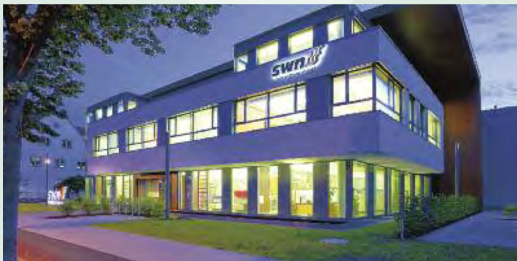
The net-plus-energy administration building of the municipality Neumarkt.