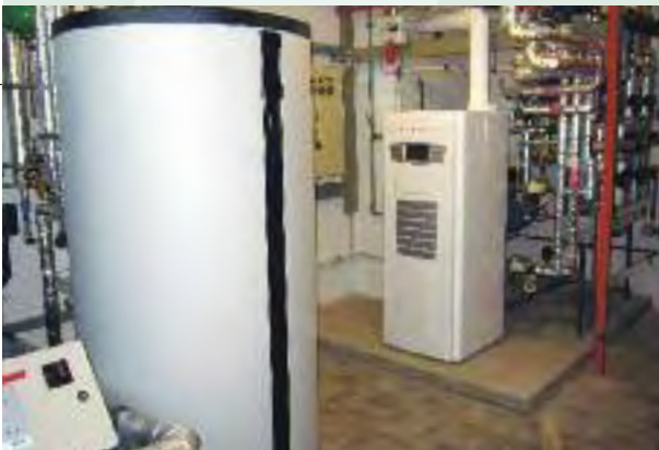
The Micro cogeneration plant using fuel cells.

T he municipality of Sanem in Luxembourg has been highly innovative when it comes to efficient energy usage. Starting September 2011 it was one of the first communities in Europe to test a micro-cogeneration power plant powered by fuel cells. A wooden school is used to demonstrate the interaction between “Buildings + Technology” in a wonderful and futuristic setting. The goal is to