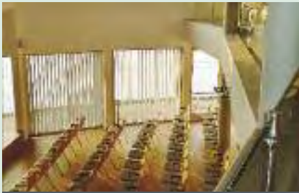
Recently built, the new centre of excellence for construction and energy in Großschönau.

ros were invested with expertise coming directly from the region. A lot of the planners and craftsmen involved in the planning and building of the passive houses were trained and educated in Großschönau. The modern training rooms are used to train and educate building planners, craftsmen, technicians and municipal politicians. Just in the first three months of 2012, 90 people were trained as passive house craftsmen, planners and energy advisors. In March 2012 Sonnenplatz will be expanded to include Sonnenwelt (Solar World) – an exhibit available throughout the year discussing energy-efficient construction, homes, renovation and living.