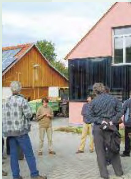
Centrum Veronica Hostětín: The first passive house of a municipality in the Czech Republic.