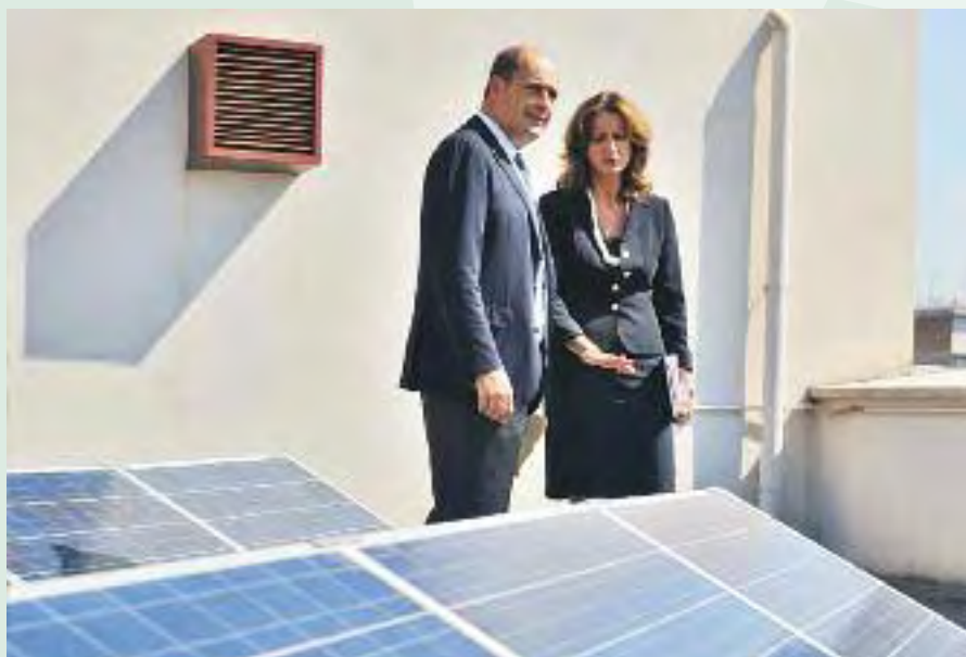
Climate protection is made a matter for the boss – president of the province Rome, Nicola Zingaretti.

KONTAKT: www.pattodeisindaci.provincia.roma.it