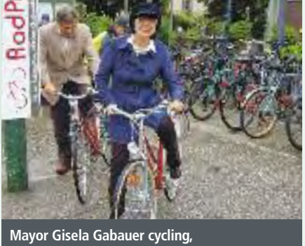
and takes the lead by example

wenty-seven events in 18 days. At the World Environmental Weeks - Enjoying the Climate Week 2011 in Gallneukirche, Austria the focus was entirely on climate protection. The whole community took part from pre-schools and schools, both parishes, clubs, businesses and restaurants. Citizen involvement models, energy independence, regional planning agreements and water usage in gardens were discussed and information provided. Climate protection through walking could be seen in the musical city walk and the environmental hike. Climate protection to be enjoyed, in the newly opened thirdworld store on the market square the soil federation gave away plants for free. The