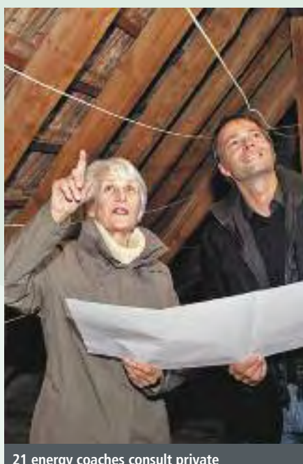
21 energy coaches consult private builders and planning professionals.

n 2008 more than three quarters of all Zurich residents voted for the 2000 watt society. Reduction of energy consumption by two-thirds, one ton of CO<sub>2</sub> per person at most and the doing away entirely with nuclear energy were the central elements of the path Zurich chose. Zurich is now right in the middle of implementation. The Energy Coaching pilot project is intended to ma-