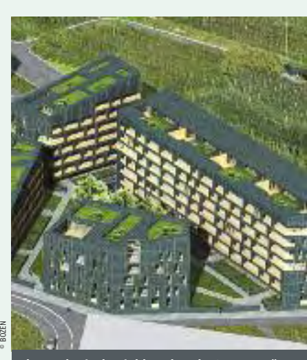
The ecological neighbourhood "Casanova" is labeled as "Climate House A".

Casanova/Kaiserau and Drususstraße. Both meet the criteria for the Climate House A label. If they were heated with oil consumption would be a mere three litres a year for each square meter. The Casanova buildings with their 950 residential units were designed so that they shaded one another as little as possible. In addition a railway station is built on the Bozen-Meran rail line. The CO2-neutral neighbourhood Drususstraße is now in planning. By 2014, 550 new apartments will be built. The new neighbourhood is also well connected to the public transportation network. Car-share spots and the pedestrian and bike paths will be available for individual mobility. Bozen is the 2012 Bicycle City of Italy and has a 71 km network of bike paths. The dual lane bike paths with centre line and two-way traffic have now become a trademark of