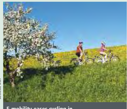
E-mobility eases cycling in the land of 1000 hills.

ucklige Welt, the land of 1000 hills is an ideal land for testing e-mobility thanks to its difficult topography. At the same time the local population