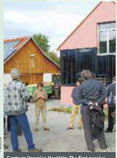
Centrum Veronica Hostětín: The first passive house of a municipality in the Czech Republic.

(Czech Republic, 240 inhabitants) CONTACT: www.bostetin.veronica.cz