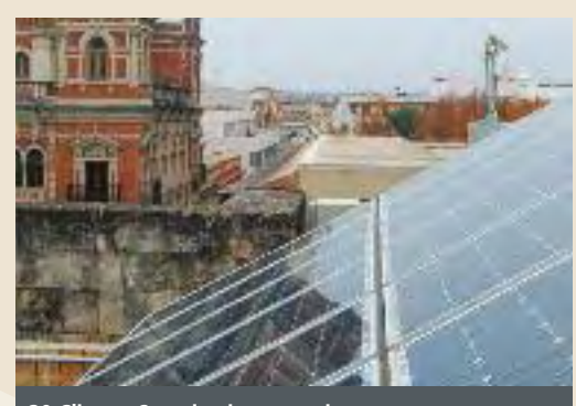
20 Climate Stars in nine countries.